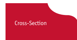
Queen Anne SATE-70