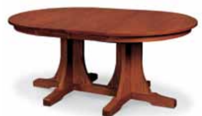
Shown with: Oval, Prairie Mission Pedestal