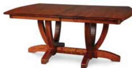
Shown with: Empire, Brookfield Pedestal