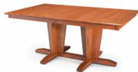
Shown with: Rectangle w/ no Corner Radius, Brooklyn Pedestal