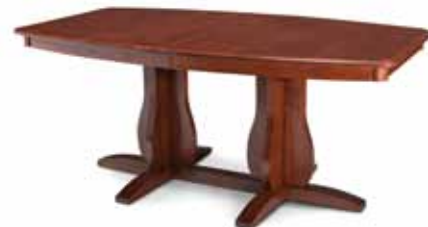
Shown with: Boat Top, Hartford Pedestal