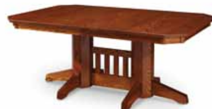
Shown with: Clipped Corner, Prairie Slats Pedestal