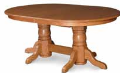
Shown with: Oval, Traditional

Build your own double pedestal table to order. The double pedestal table offers one of the most unique looks available for the dining room or kitchen. Using the examples shown here for inspiration, begin creating your own double pedestal table design.